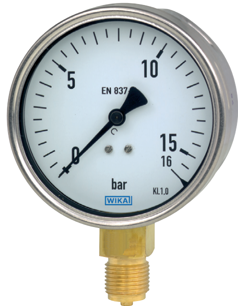
Bourdon Tube Pressure Gauge Model 212.20

0 ... 0.6 to 0 ... 600 bar or all other equivalent vacuum or combined pressure and vacuum ranges