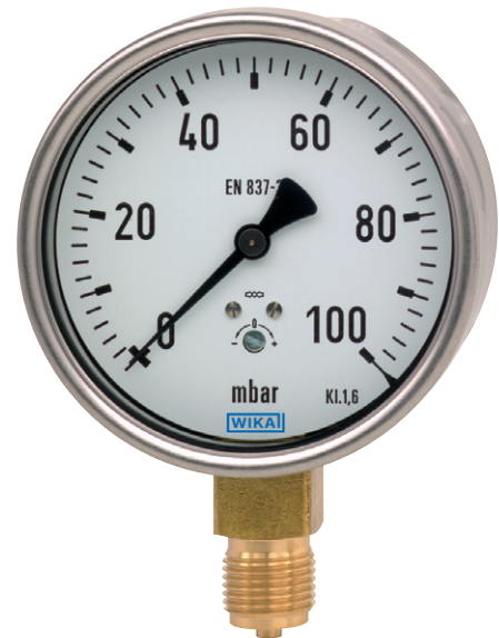
Capsule Pressure Gauge Model 612.20