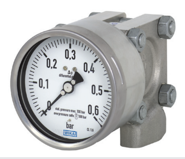
Differential Pressure Gauge Model 732.14